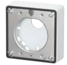
WV-QIB500-W Mount Bracket