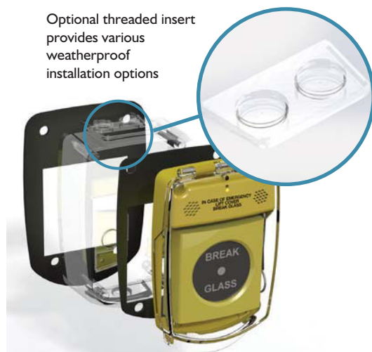
Optional threaded insert provides various weatherproof installation options